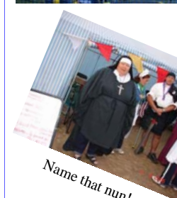
Name that nun!