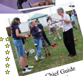
The Chief Guide tries diabolo

☆☆☆☆☆☆☆☆☆☆☆☆☆☆☆☆ ☆ A huge 'thank ☆ you' to the ☆ organisers and ☆ to everyone who ☆ made ☆ Charnwood 2006 ☆ such a week to ☆ remember. ☆☆☆☆☆☆☆☆☆☆☆☆☆☆☆