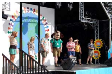
Until the next time!

Please email orders to equipstore@leicestershireguides.org or send in an order form